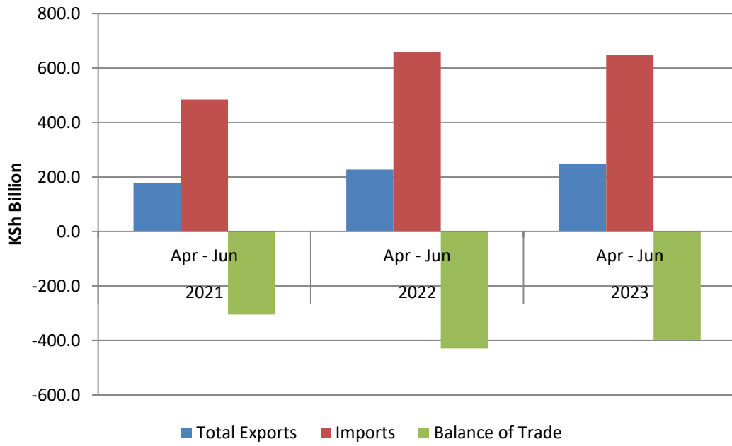
Table 3: International Merchandise Trade 1 , 2021– 2023